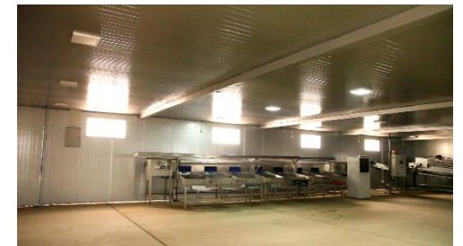
Divulapitiya - 2017 CIC CropWiz (CIC Holdings PLC)