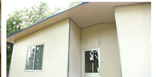
Officers Accommodation – Wadakada MAGA Engineering