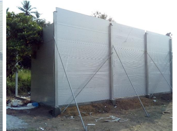
Kaduwela - 2017 Sound Proofing Unit