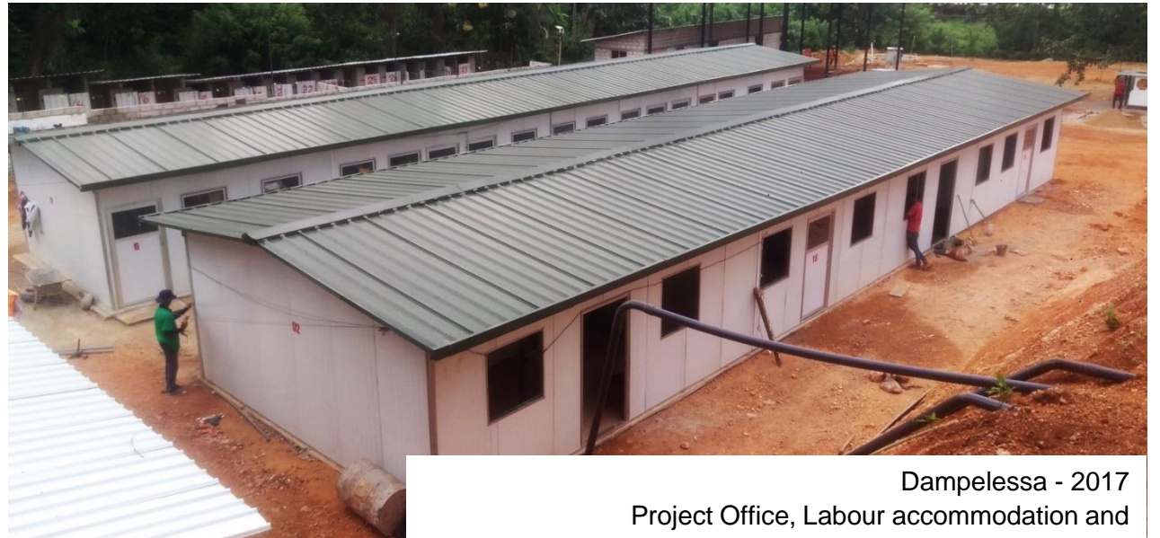
Dampelessa - 2017 Project Office, Labour accommodation and Laboratory units