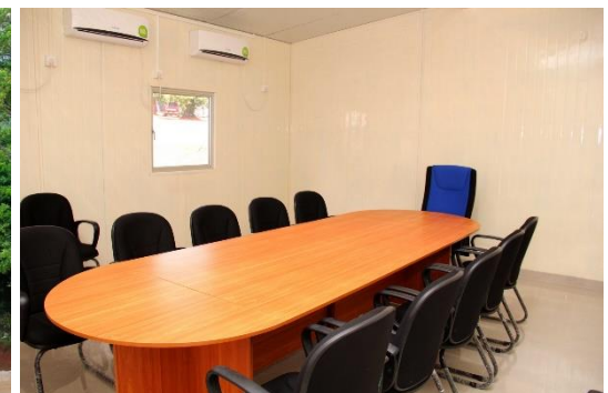
Kurunegala - 2017 Central Expressway Head Office Complex