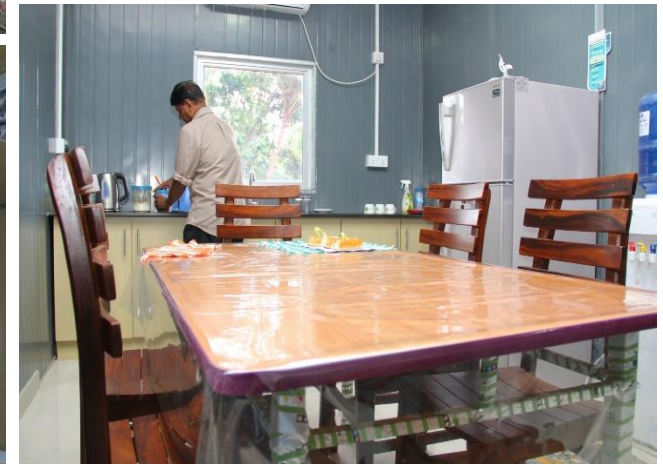
Nittabuwa - 2017 Student Accommodation/ Hostel Units and Class rooms